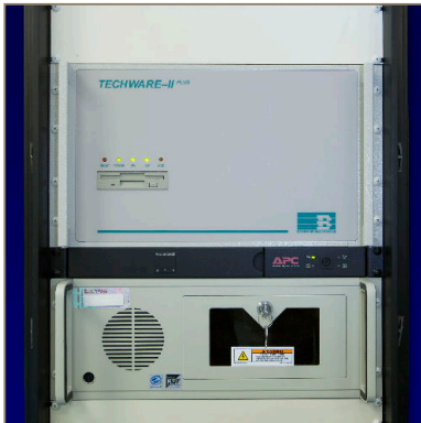
Old NT Techware controller tower

The new KDF i controller installations are shown below.