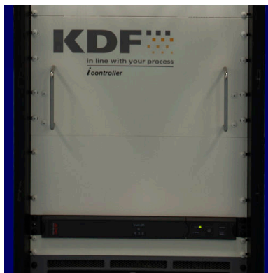
New KDF i controller tower