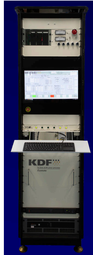
New KDF i controller tower

* Contact KDF for details on the many optional features for retrofits. Specifications subject to change.