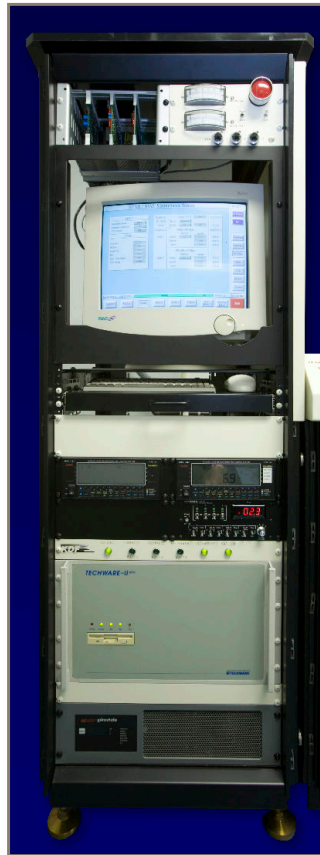
Old GT controller tower